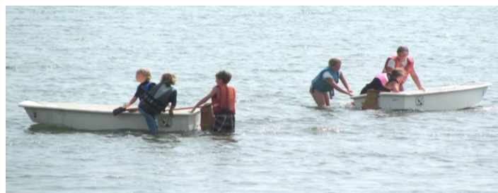
Learning to steer